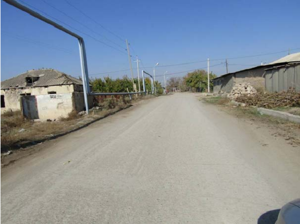
Deteriorated a/c pavement with potholes