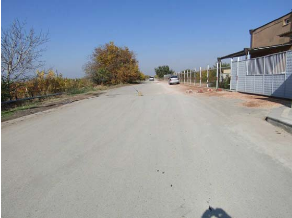
Deteriorated a/c pavement