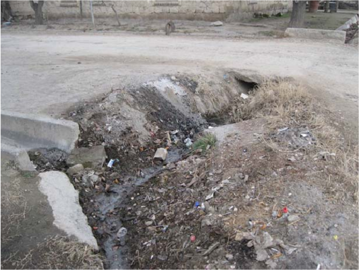
Deteriorated a/c pavement, mostly earth road