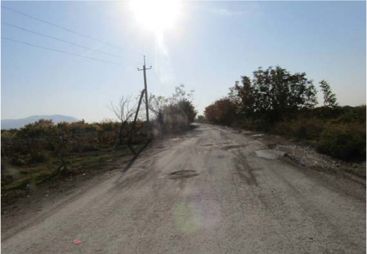
Some spots of asphalt, mostly earth road